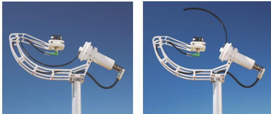
CSP Services Twin-Sensor Rotating Shadowband Irradiometer (RSI) in rest position (left) and during the rotation (right)

The Rotating Shadowband Irradiometer (RSI) is an innovative meteorological measurement instrument for quantitative solar irradiance assessment. It consists of two horizontally leveled silicon photodiode radiation detectors, situated in the center of a spherically curved shadowband. While the shadowband is in its rest position below the sensor, the photodiodes measure Global Horizontal Irradiance (GHI). Usually once per minute, the shadowband rotates around the radiation sensors for approximately one second. During the rotation, the shadowband blocks the direct beam irradiation from the sun within a brief instant. This causes a momentary drop of the photodiode signals and thus allows the determination of the Diffuse Horizontal Irradiance (DHI) and the subsequent calculation of the Direct Normal Irradiance (DNI) from GHI, DHI and the known solar incidence angle.