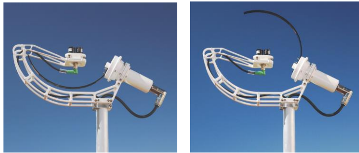
CSP Services' Twin-Sensor Rotating Shadowband Irradiometer (RSI) in rest position (left) and during the rotation (right)

Circumsolar radiation can be characterized using the angular distribution of the radiance around the center of the sun – the so-called sunshape. The amount of circumsolar radiation varies strongly with time, location, and sky conditions. Therefore, sunshape measurements are recommended to be included in solar resource assessment.